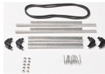
iM24XX-BEZEL-LID Lid Bezel Kit