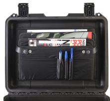
iM24XX-LIDORG Lid Organizer